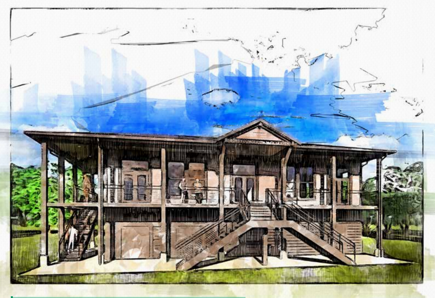
The Boyd Center will provide a classroom, conference room, kitchenette and storage to serve students and the greater Midlands community.