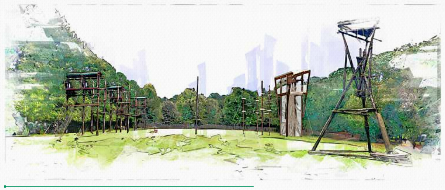
The Odyssey Course will double in size and a new ropes course component called the Alpine Sky Park will be added to the PEAK challenges.